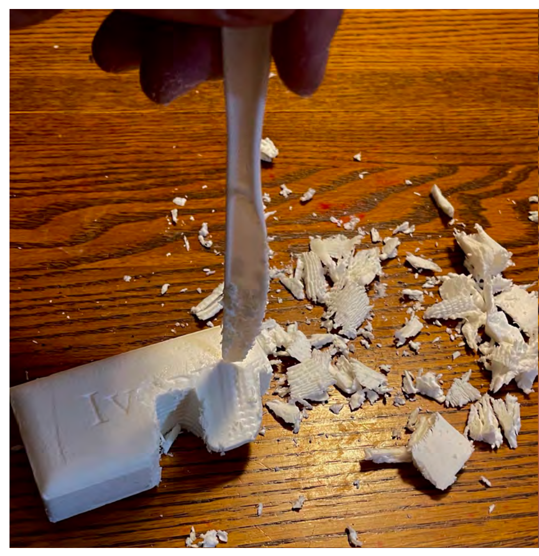
*Make sure the knife is vertical for the this step.

Lay your eagle head down, find where you want to place the eye, then gently begin twirling the knife adding more pressure until the desired size of the circle is met.