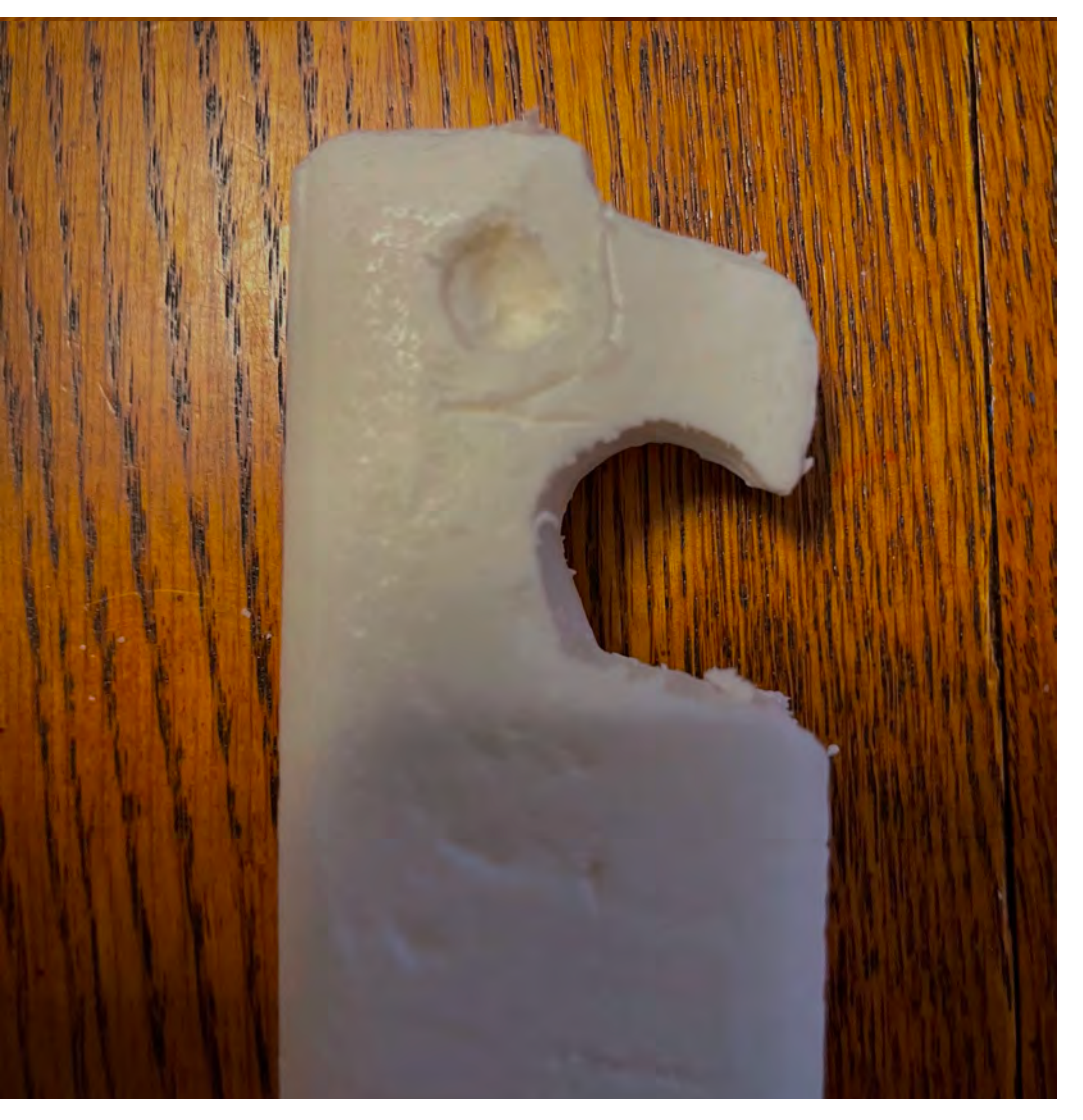
*You can use the opposite edge of the blade to smooth out the surfaces.

Continue moving the piece around, round off edges as you see fit.