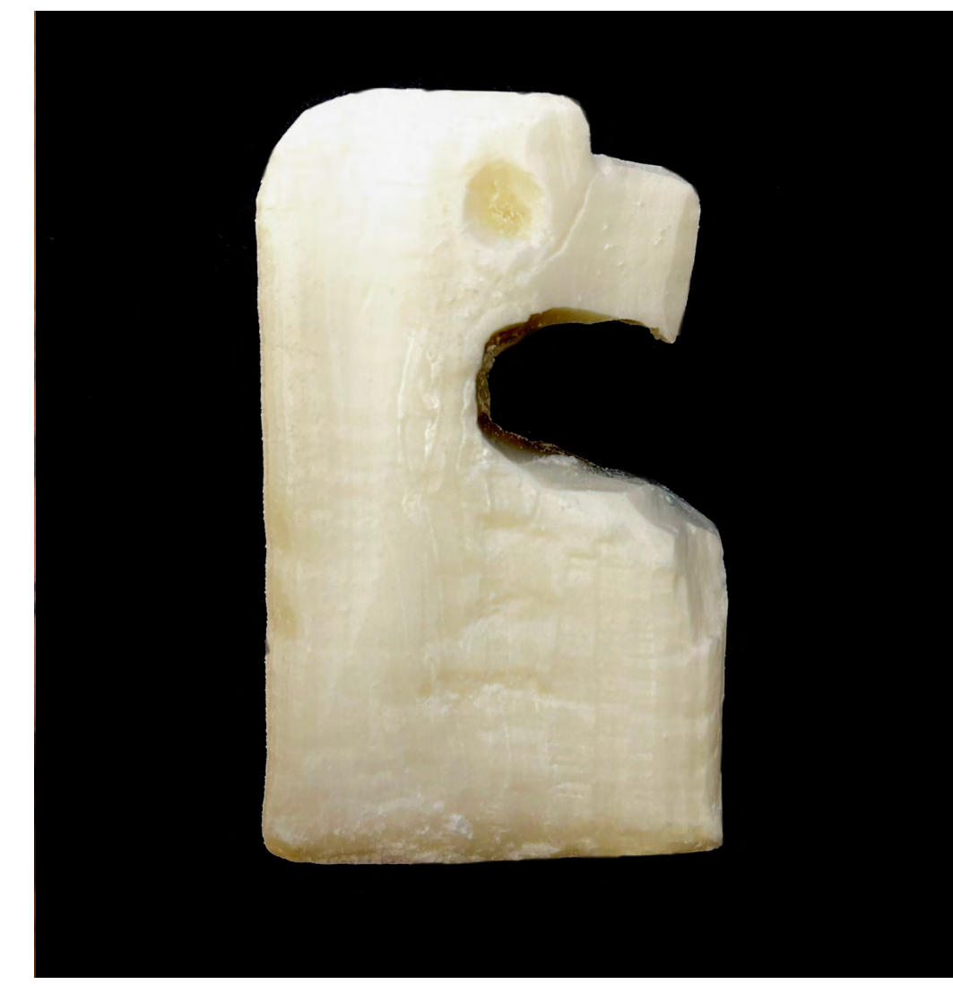
*If you want to continue practicing, always use "Ivory" soap for best results.

These steps are meant as a guide. Your work may look different or you may want to do different steps. This is all great, the piece you make is a piece formed by you and your mind. In that sense, it is exactly how it is supposed to be!