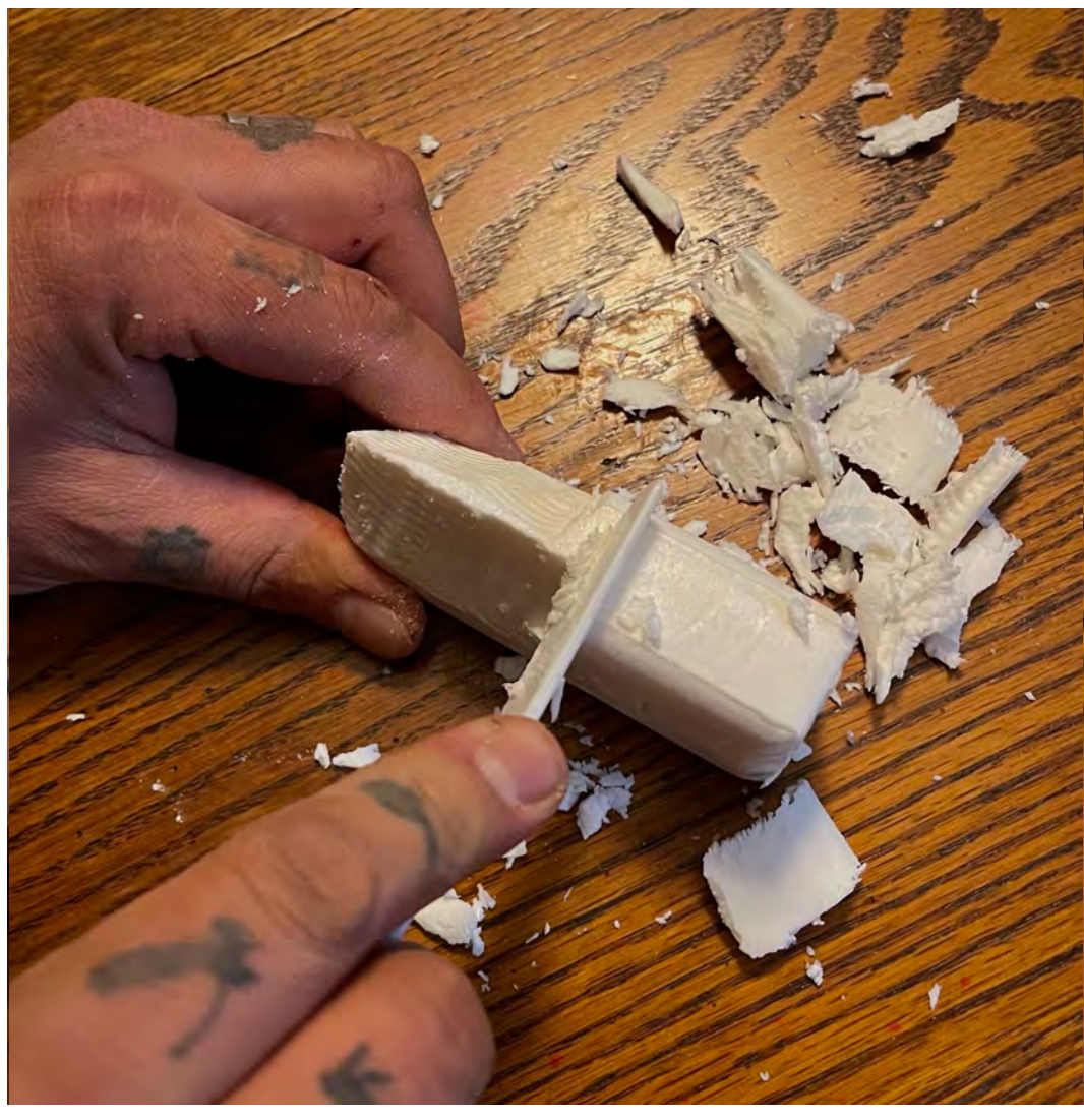
*Again, start slowly, in a scooping motion you will begin to carve out a notch.