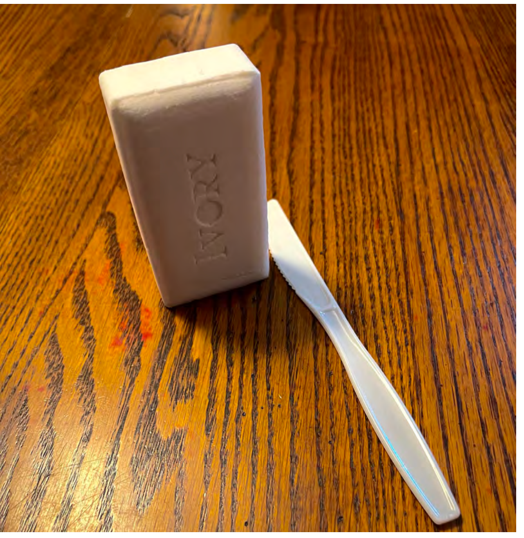
*This is art by subtraction. Take your time and go slow. If you cut off too much, there's no putting it back on!