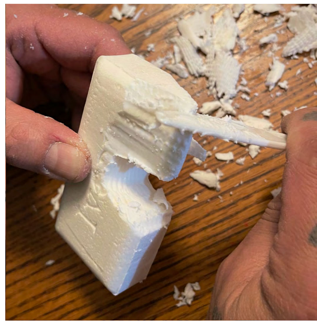
*If unsure how far back to go, check step 9 ->

Standing the piece back up, in a horizontal fashion, shave off approximately .25". But do not go past the middle of the head.