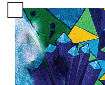
Transcendence 2019 Parking lot façade of Carey's Brew House 58 Bridge Street (adjacent to E. William Street)