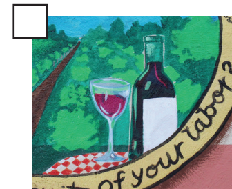
The Art of Industrious Minds 2018 Parking lot façade of 80 E Market Street