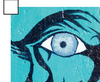
Perfect Imperfection 2014 Denison Park Vehicle Underpass