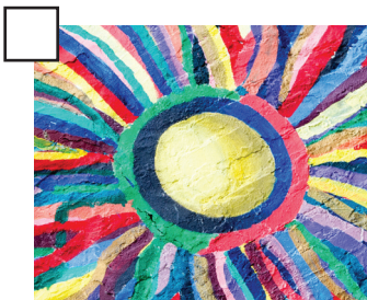
Mountain as Metaphor 2011 Parking lot façade of the Corning Revere Store 114 Pine Street