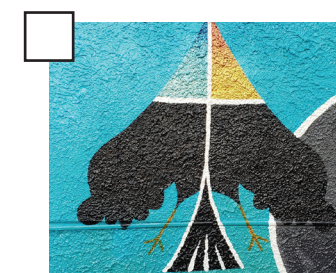
Earth Mother 2020 Parking lot façade of Carey's Brew House 58 Bridge Street (adjacent to E. Pulteney Street)