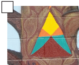
Tree of Life 2010 Alley façade of Connor's Mercantile 16 E Market Street