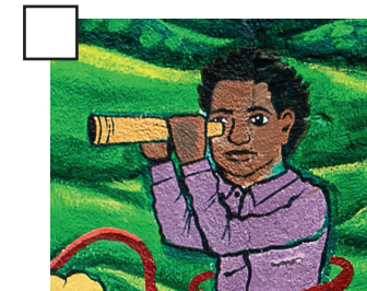
The High School Learning Center Family: What is Family to You? 2017 Alley façade of 114 Chestnut Street