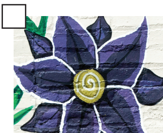
Garden of the Spirit 2012 Alley façade of Connor's Mercantile 16 E Market Street