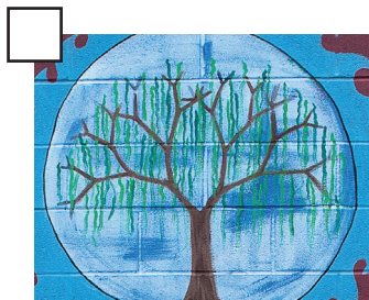
As Above, So Below 2012 Parking lot façade of the Corning Revere Store 114 Pine Street