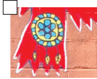
The Flight of Balance 2015 Alley façade of Safari Smiles Pediatric Dentistry 100 W Market St