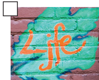
Wild Grace: The Path of the Deer 2013 Alley façade of 21-25 E Market Street