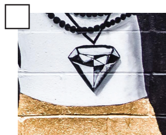
Visibility of Truth 2016 Alley façade of Capn' Morgans 36 Bridge Street